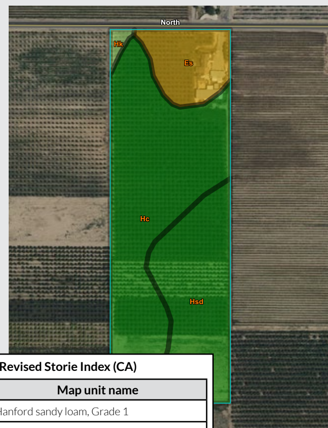
California Revised Storie Index (CA)