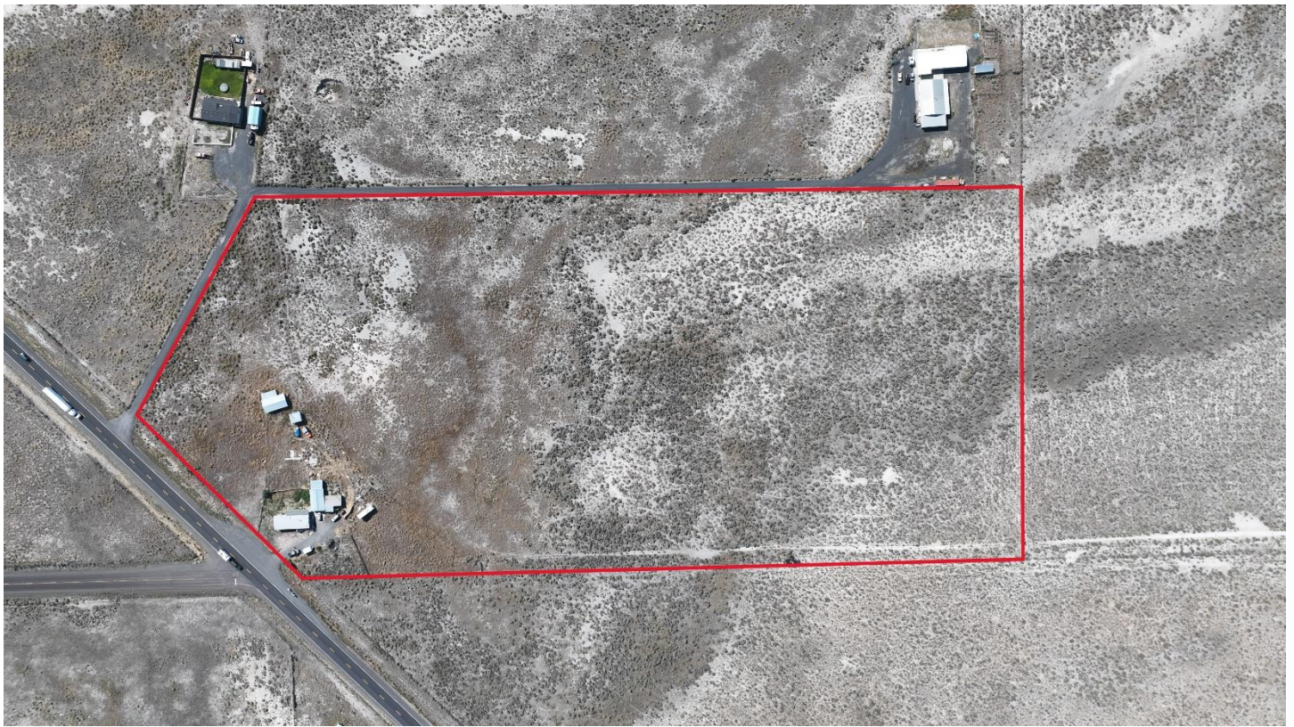
Harney County, Oregon, 21 AC +/-