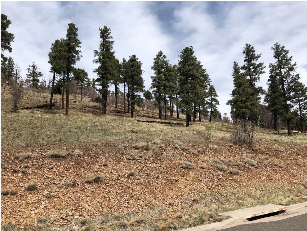
Looking North on the property