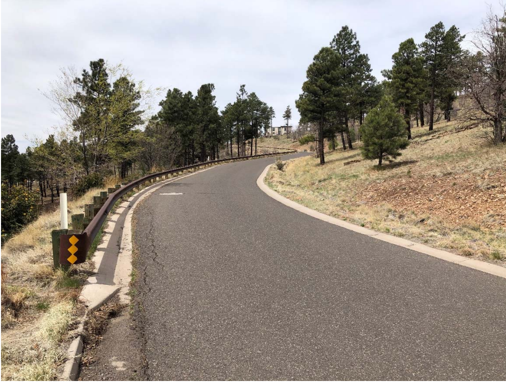
Looking West up Lower Coconino Ave on the property