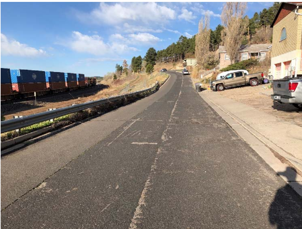
Looking West up Lower Coconino Ave towards the property