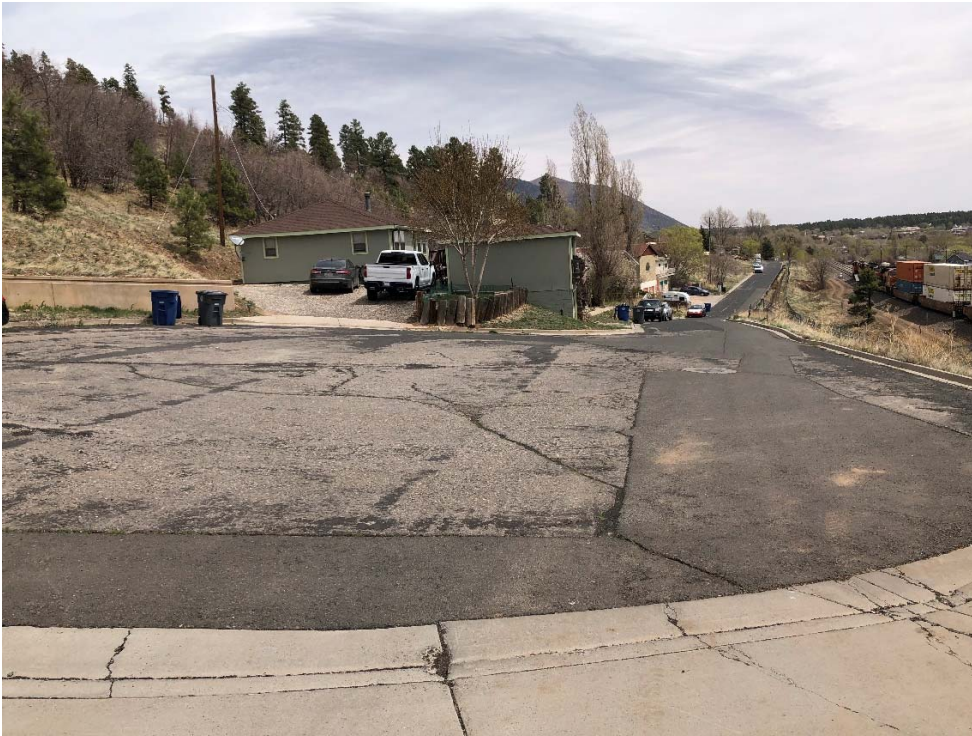
At the Property Looking East down Lower Coconino Ave