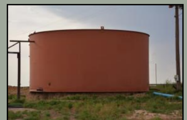
115, 000 Gallon Water Tank