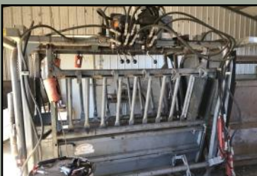
Bowman Chute in Processing Barn