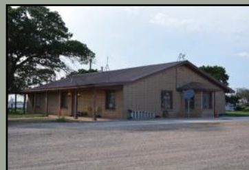
Office & 100,000 Lb. Truck Scales