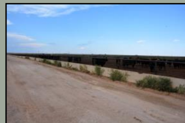
Feed Alley, Bunk, & Pens