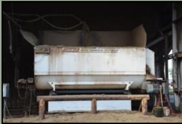
Roto-Mix 620-16 Stationary Mixer