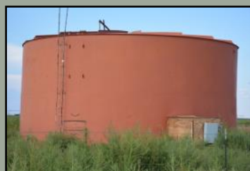
115,000 Gallon Water Tank