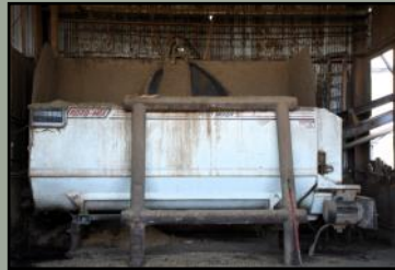
Roto-Mix 620-16 Stationary Mixer