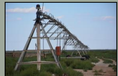
7 Tower Pivot To Be Installed