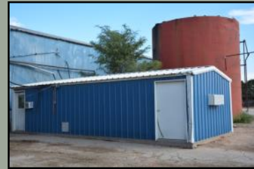
Micro Room & 56,000 Gallon Liquid Supplement Tank