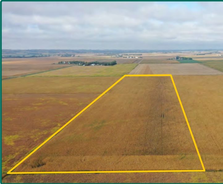
East looking West