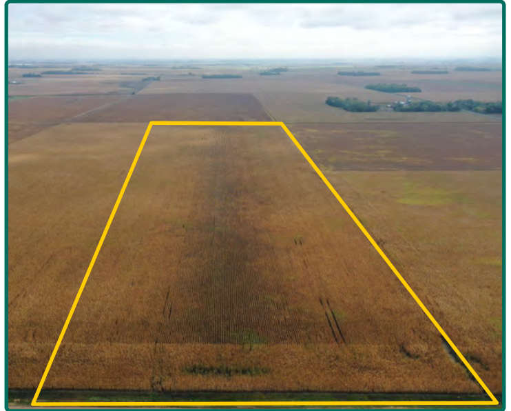
West looking East