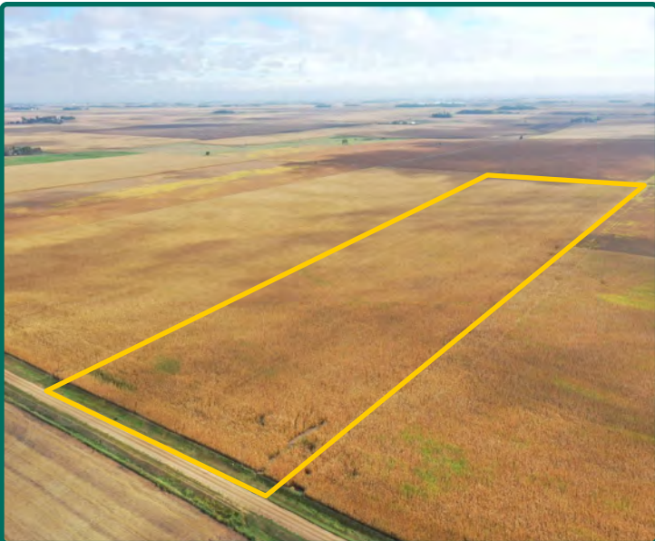
Southwest looking Northeast