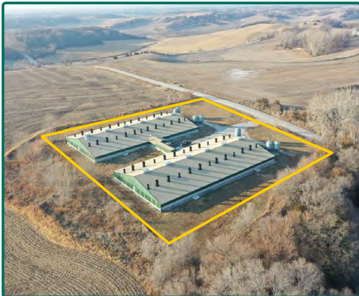
West Site - Looking Northwest