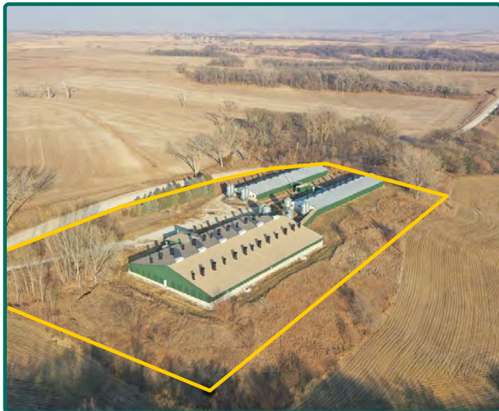
East Site - Looking Northeast