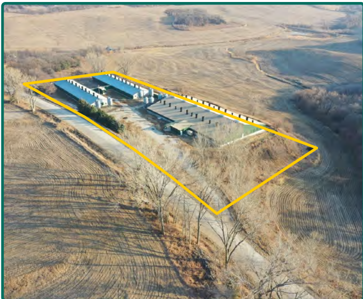
East Site - Looking Southeast