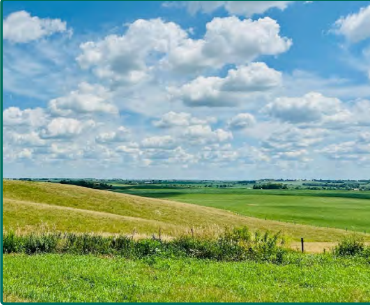
View to the Southeast