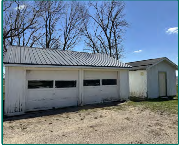
Garage & Shed