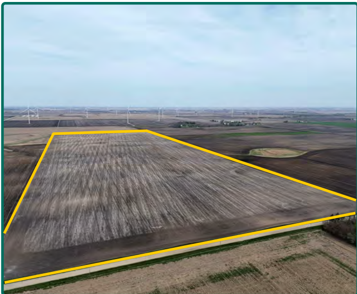
Southwest Looking Northeast