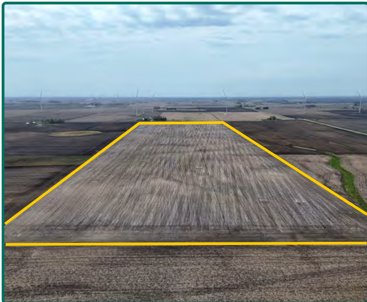
North Looking South