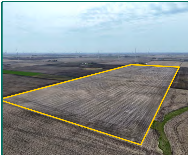
Northwest Looking Southeast