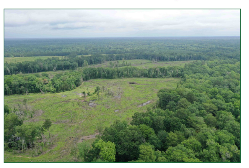
Socagee Creek offers 70 acres of planted pine plantations.

This historic timberland tract offers 70 acres of fully stocked pine plantation established in 2024. The plantation pine was intensively sight-prepped, planted with second-generation containerized seedlings from the IFCO nursery in DeRidder, LA, and sprayed for herbaceous weed control to minimize competition to the seedlings.