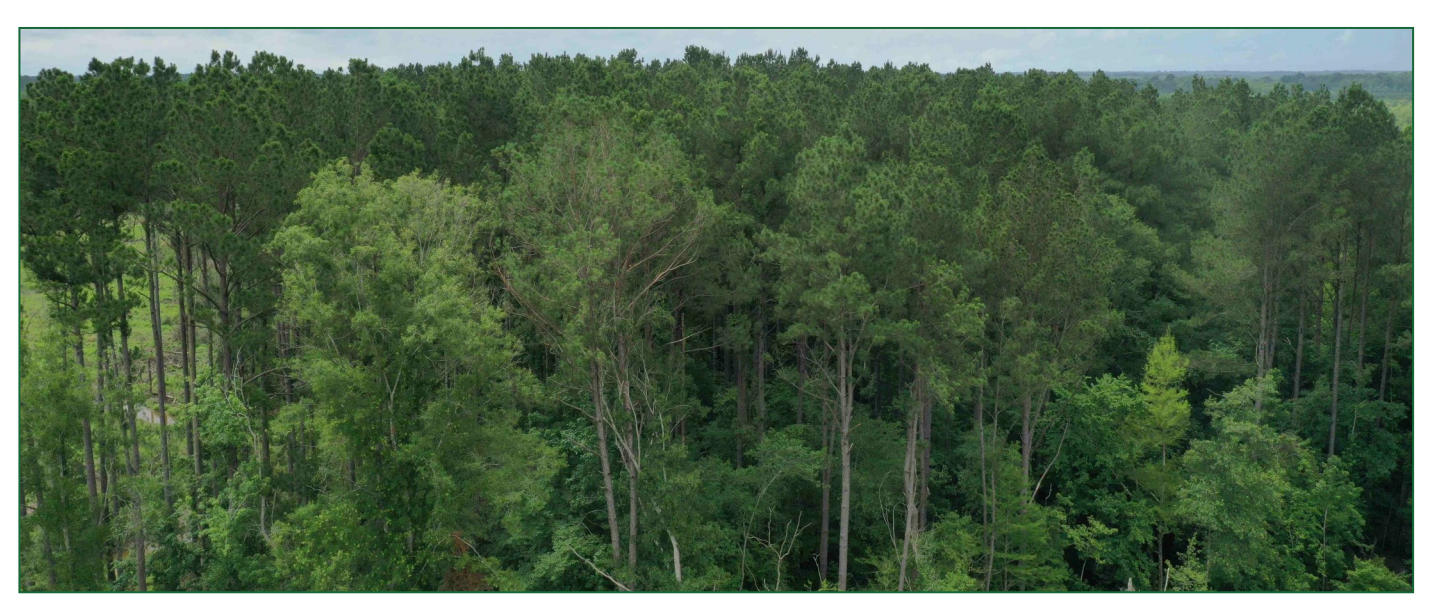
The mature pine offers the potential for some immediate return on investment.

Fountains Land is the exclusive broker representing the seller's interest in the marketing, negotiating and sale of this property. Fountains has an ethical and legal obligation to show honesty and fairness to the buyer. The buyer may retain brokers to represent their interests. All measurements are given as a guide, and no liability can be accepted for any errors arising therefrom. No responsibility is taken for any other error, omission, or misstatement in these particulars, nor do they constitute an offer or a contract. We do not make or give, whether in these particulars, during negotiations or otherwise, any representation or warranty in relation to the property.