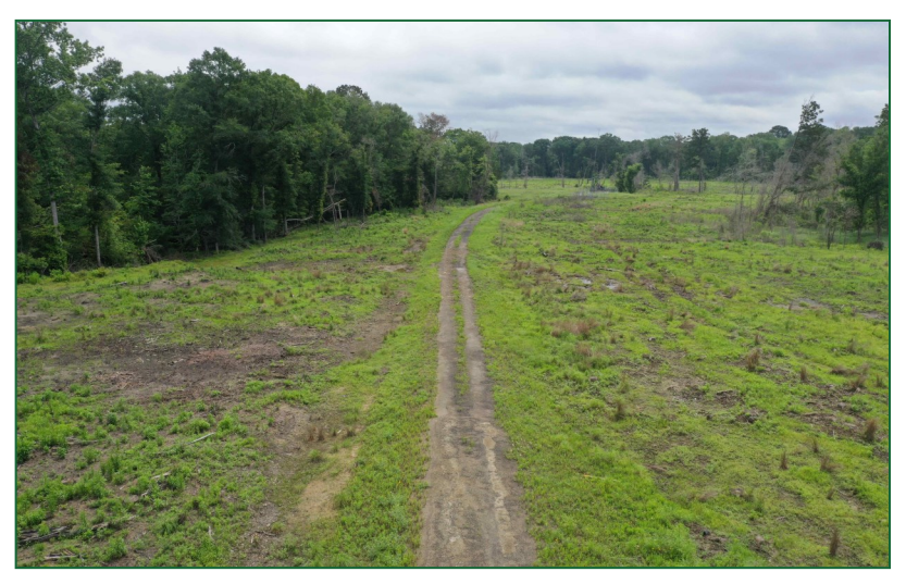
An internal gravel road provides easy travel through the property.