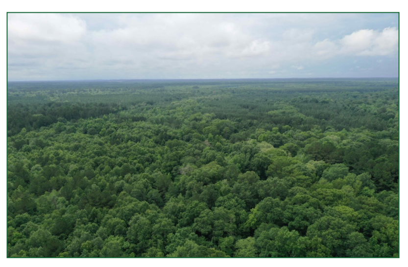
Expansive timberland for miles around.