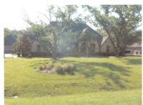
mailing address 11848 Native Drive Fort Worth, Texas

PC/TECH: FC/SWIM DATE: 06-27-17 SCALE: 1"=30' ASC NO.: 1706502