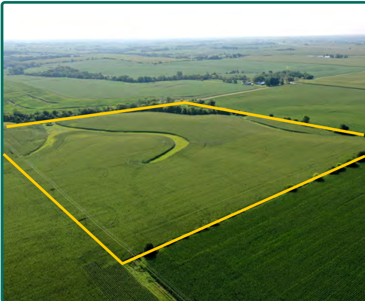
Northwest Looking Southeast