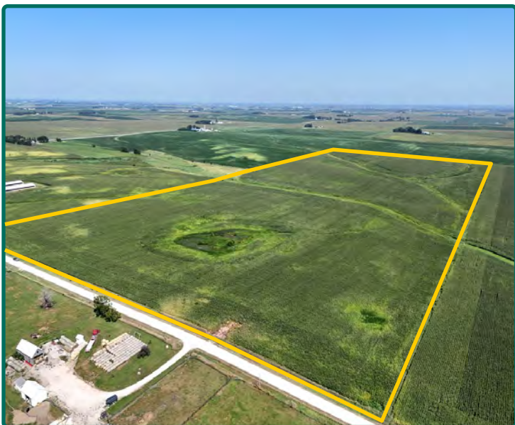
Southwest looking Northeast