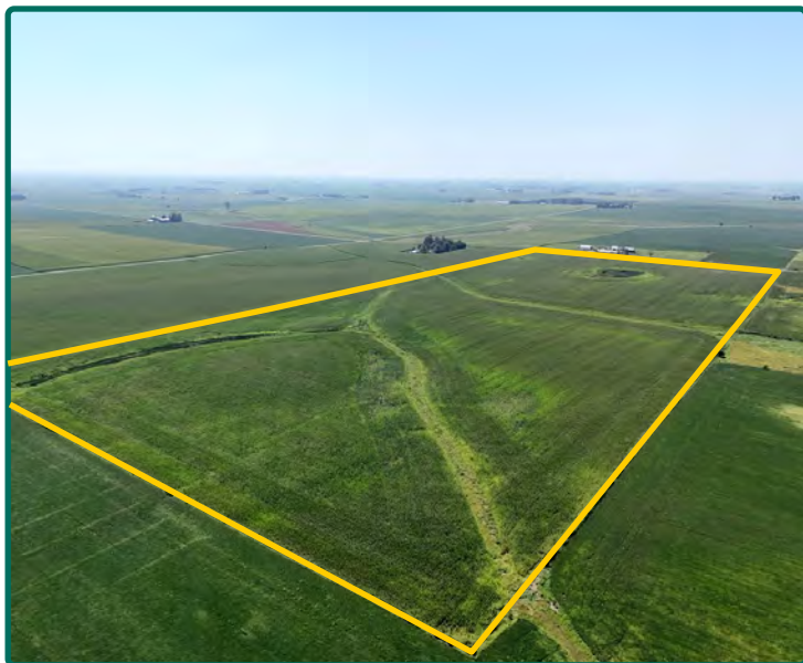
Northeast looking Southwest