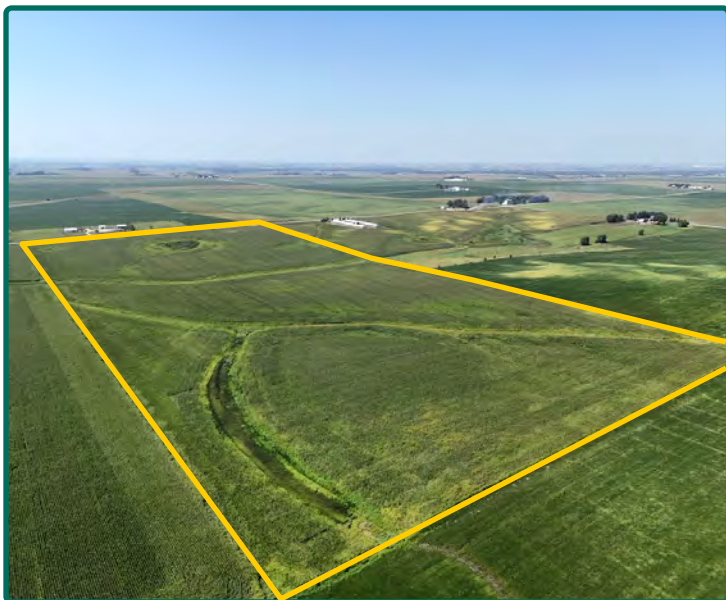
Southeast looking Northwest