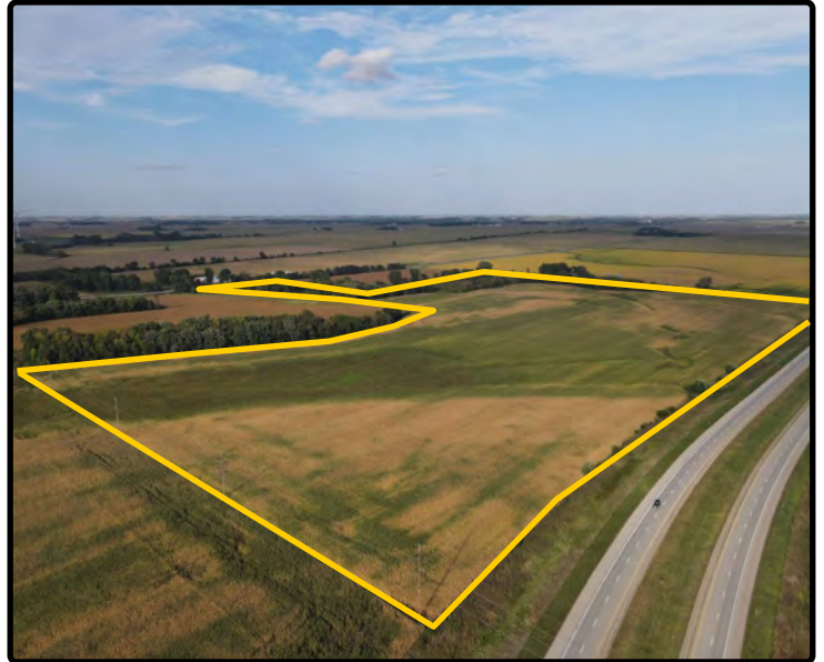
Southwest looking Northeast