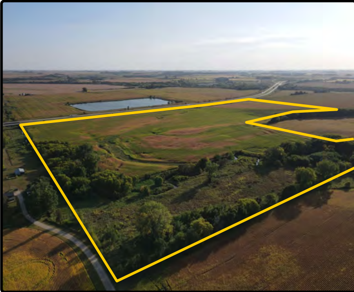
Northeast looking Southwest