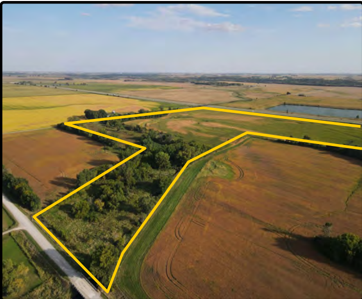
North looking South