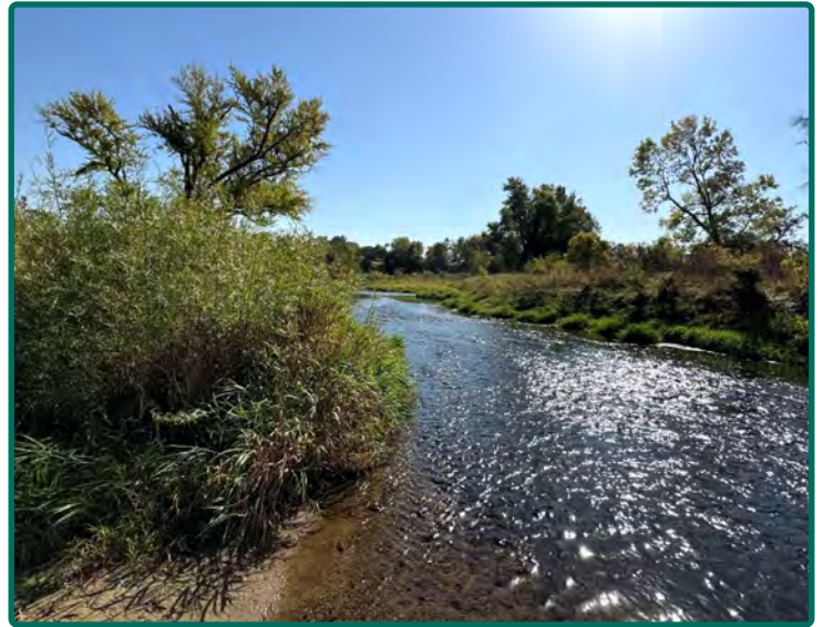
North Looking South