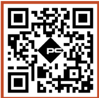
VIEW THIS LISTING ONLINE!