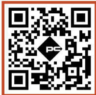
REGISTER FOR ONLINE BIDDING!