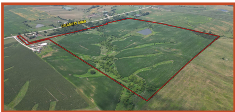
CREAMERY ROAD AFTON, IA 50830