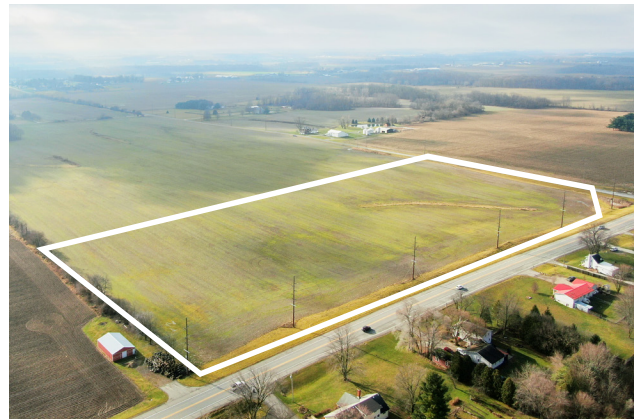
15+/- Tillable Acres