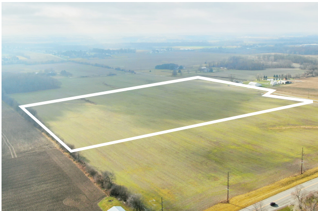
30+/- Tillable Acres