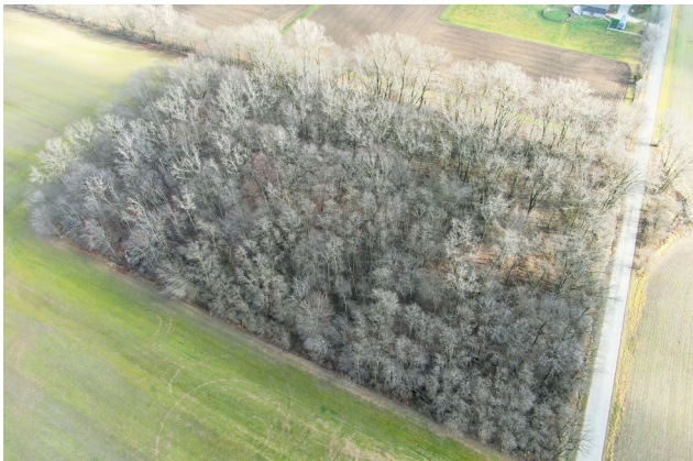
5.85+/- Wooded Acres