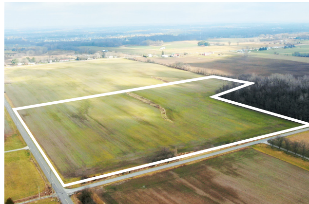
25+/- Tillable Acres