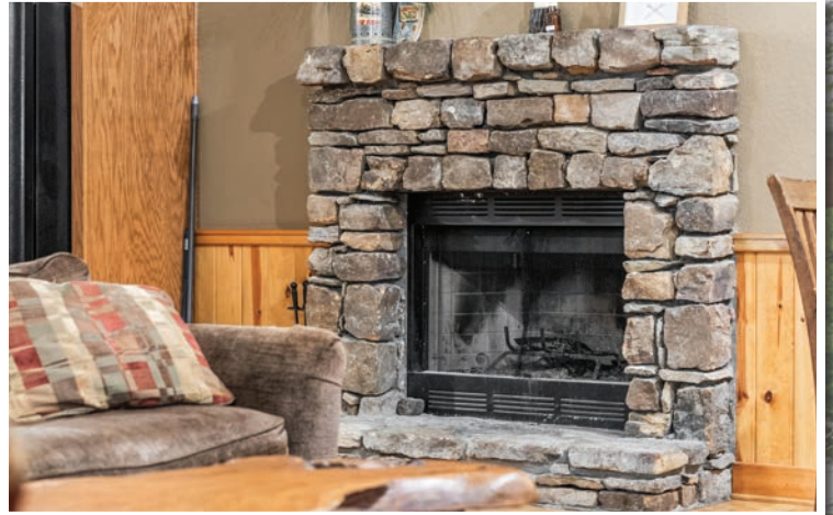
CABIN #8 & #9 DUPLEX