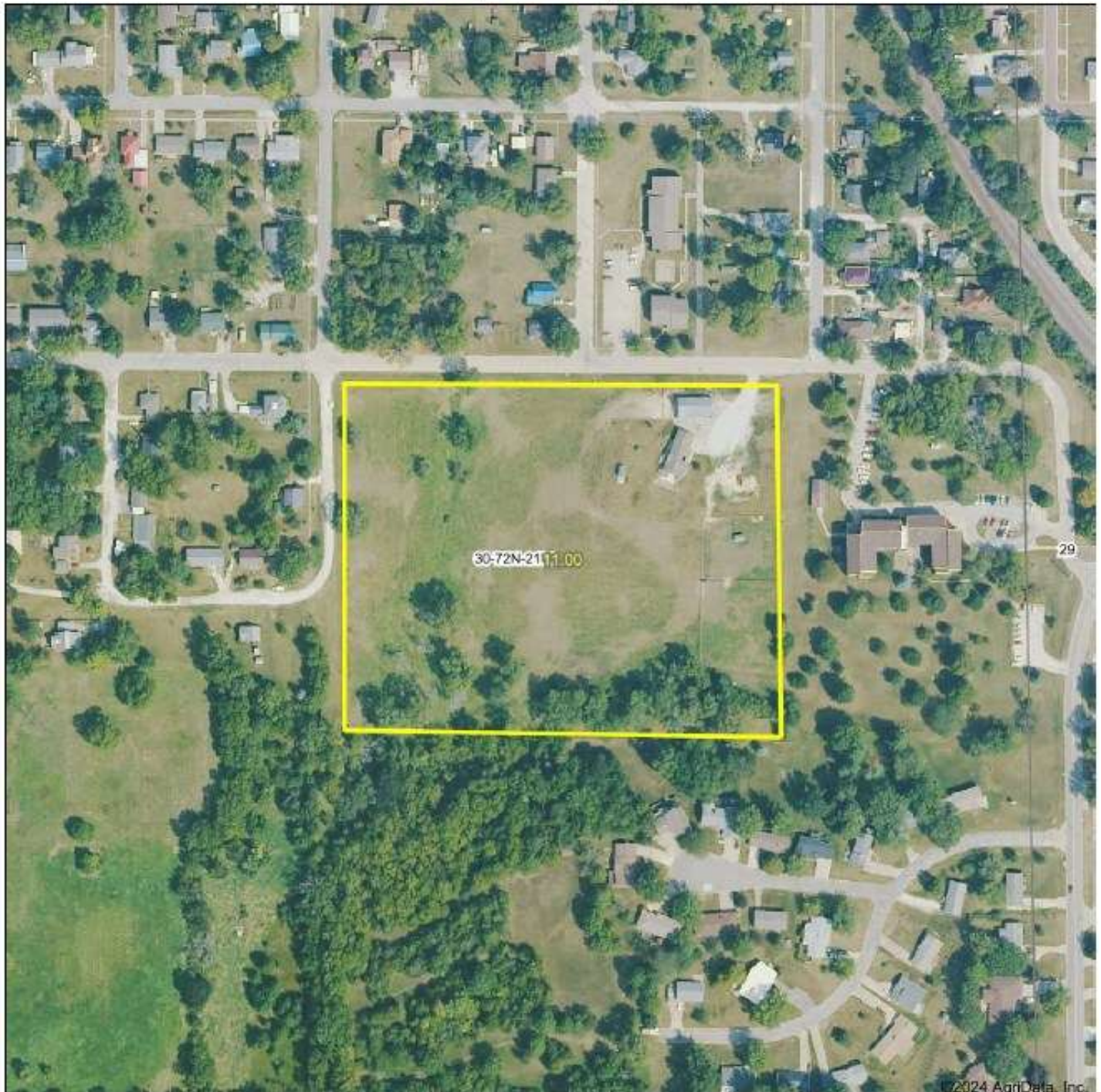
Aerial Map Boundary Lines Are Approximate