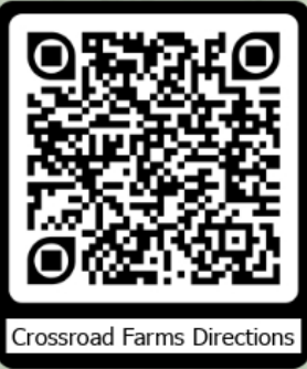
Crossroad Farms Directions