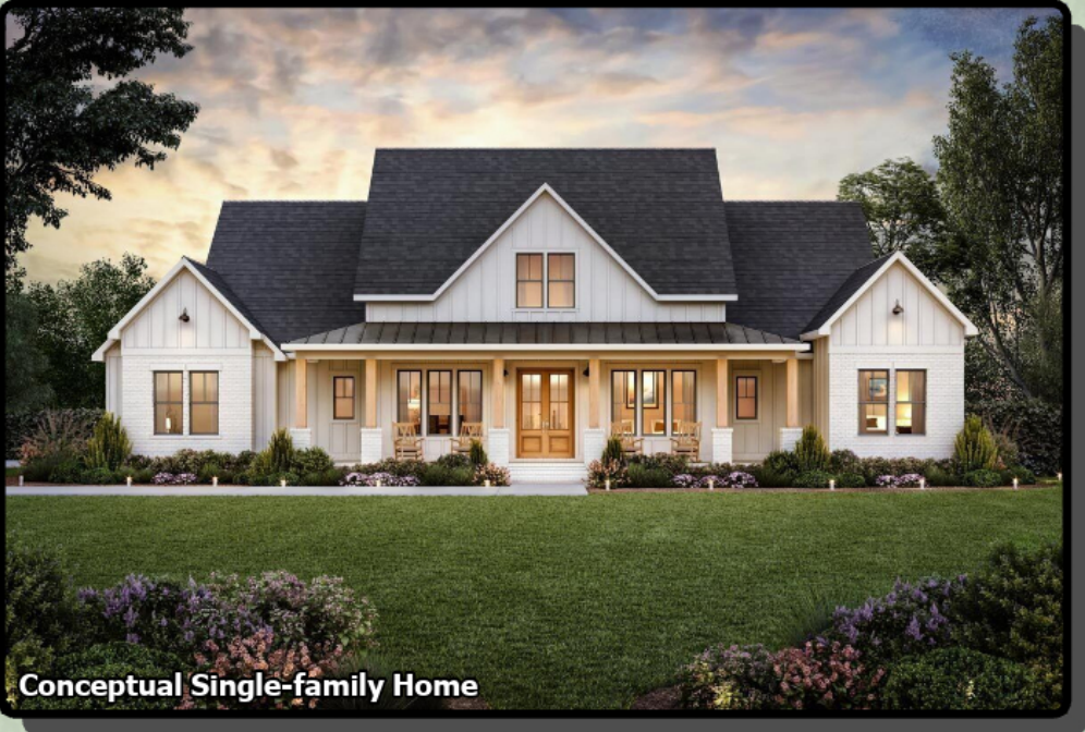
Conceptual Single-family Home