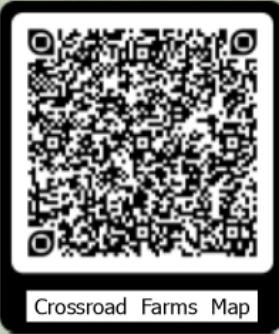
Crossroad Farms Map