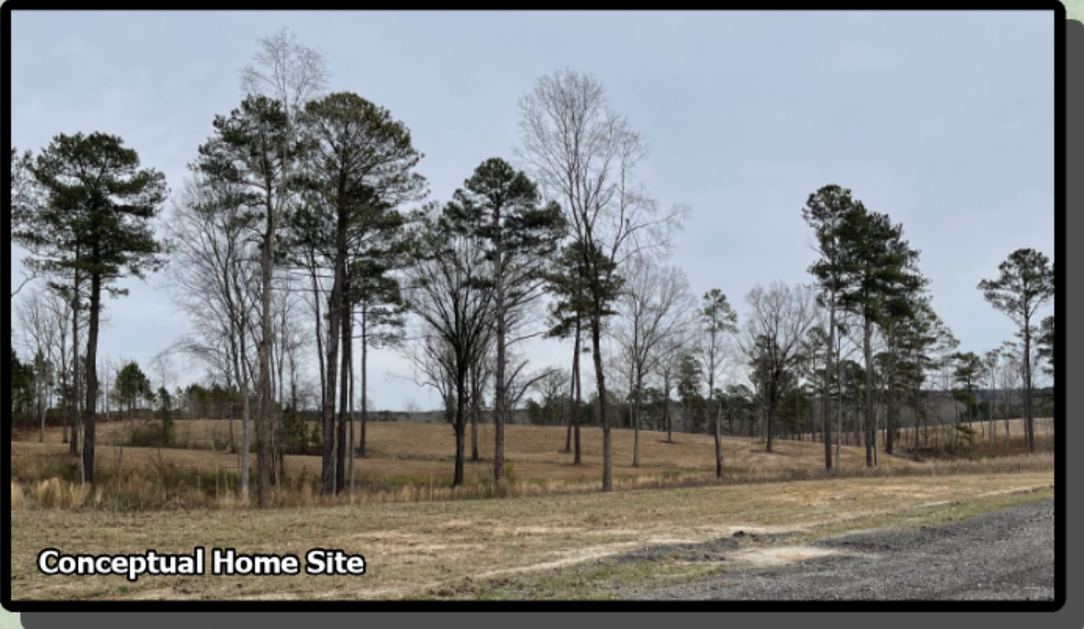
Conceptual Home Site