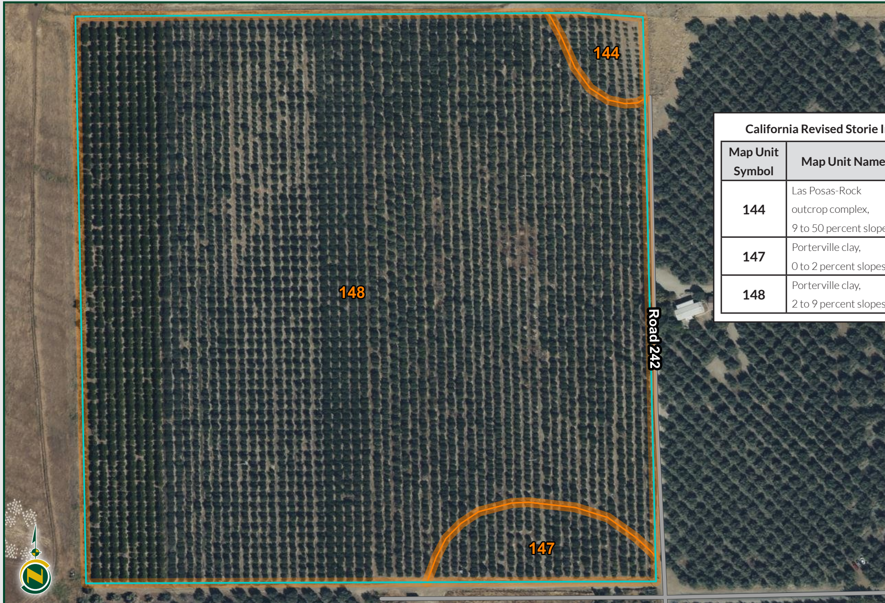
California Revised Storie Index (CA)