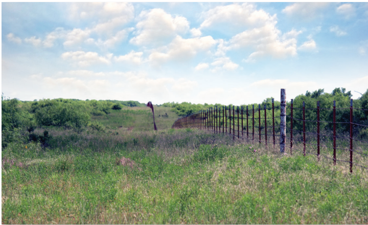
$17,800,000 | 31,000± Acres | RANCH