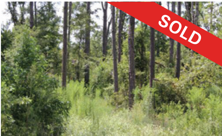
$2,233,004 | 1,353± Acres | AUCTION