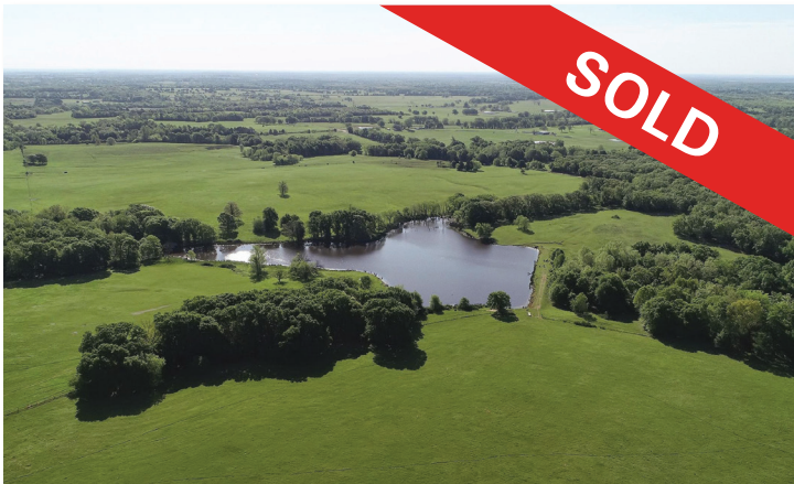
$2,554,555 | 1,087± Acres | AUCTION