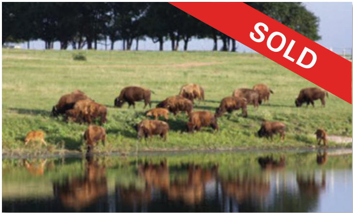
$1,495,00 | 311± Acres | RANCH