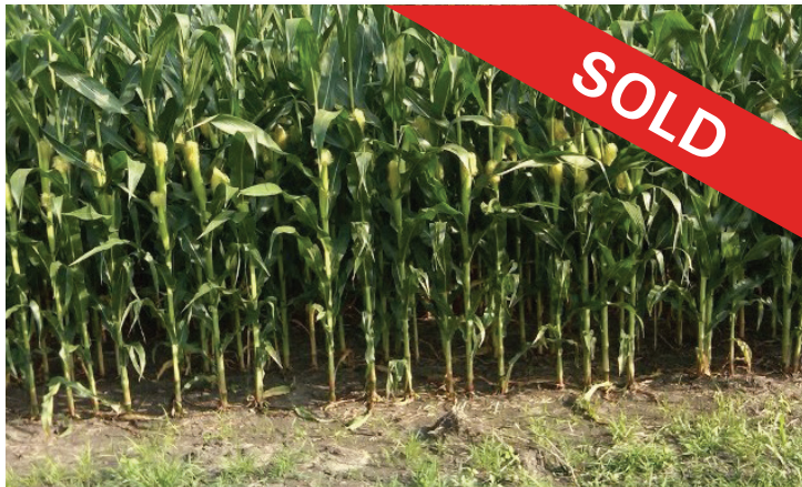
$926,603 | 462± Acres | FARM