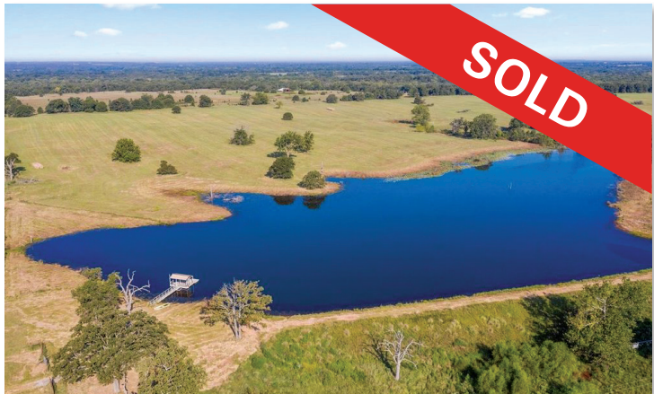
$4,500,000 | 194± Acres | LAND