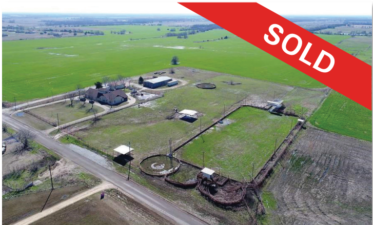
$825,000 | 247.8± Acres | RANCH