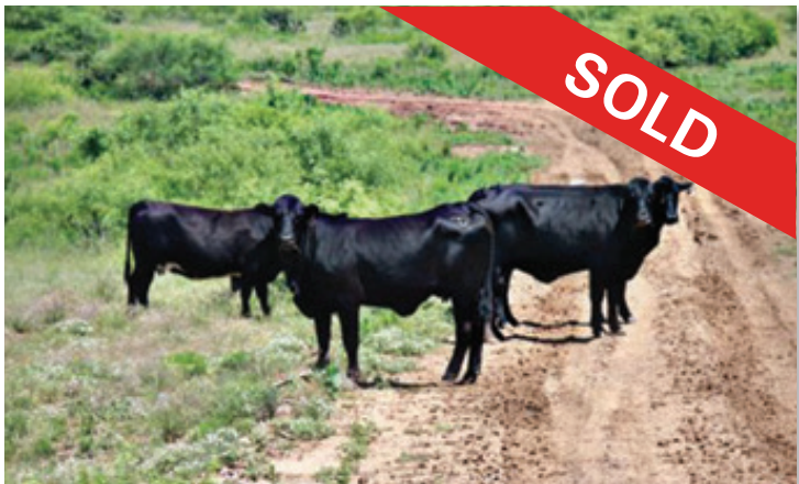
$2,531,042 | 3,728± Acres | LAND