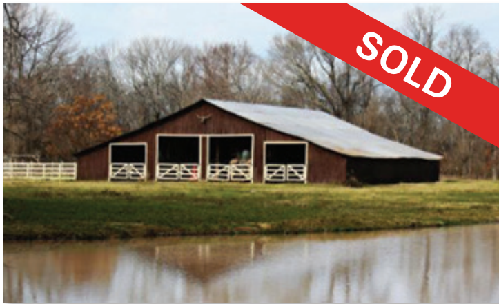
$1,367,893 | 770± Acres | RANCH