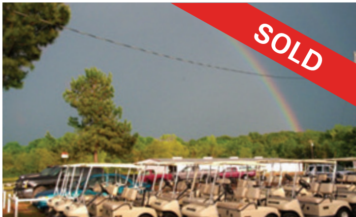
$600,000 | 98.90± Acres | COMMERCIAL