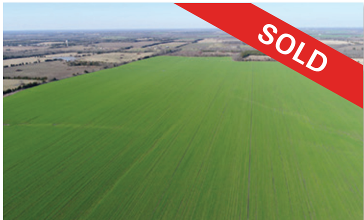
$1,700,000 | 705± Acres | FARM